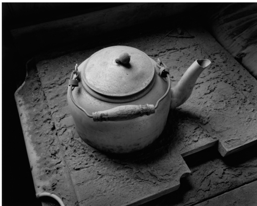
TEA KETTLE WHEATON AND LUHRS HOTEL BODIE, CALIFORNIA