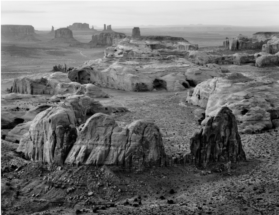
MONUMENT VALLEY, DUSK FROM HUNT'S MESA ARIZONA