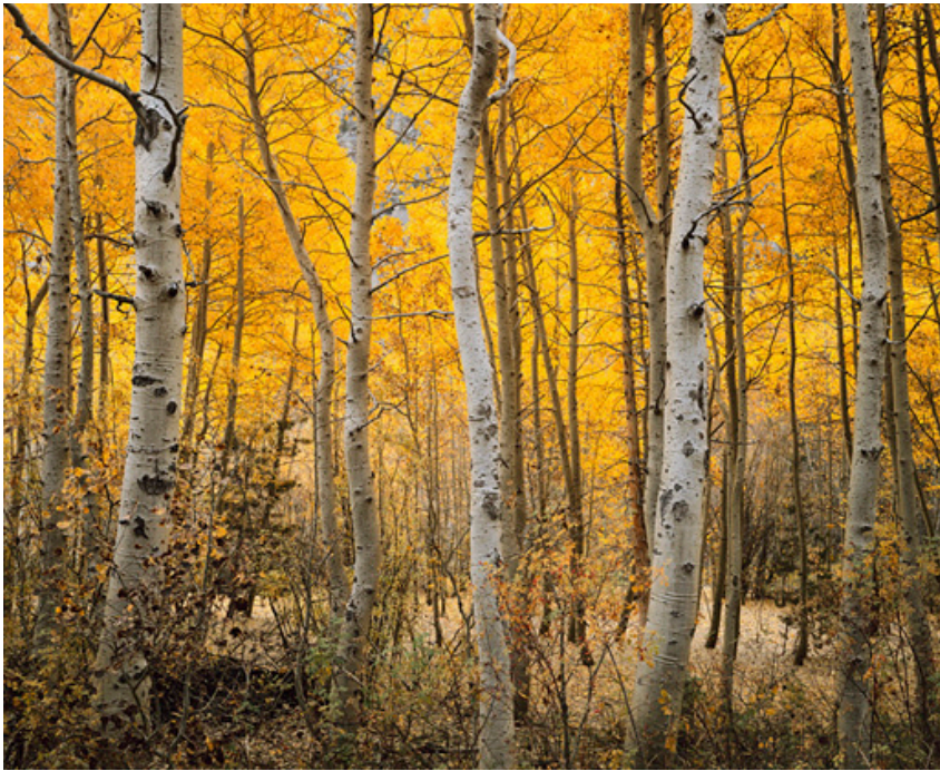
ASPEN, AUTUMN JUNE LAKE CALIFORNIA